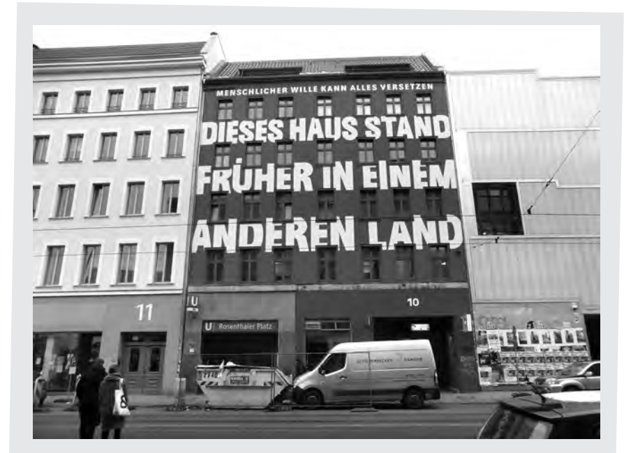
"Human will can move everything. In the past, this house stood in a different country", building on Brunnen Str. Berlin

their living conditions still continues. "Statistics in various fields still show significant differences between East and West Germany," the Federal Statistical Office stated in 2014. Their research found monthly incomes in East Germany were about 25% lower<sup>28</sup>. These differences are another reason why some people cannot bring their own experience in line with the success story of the reunification, which is repeated annually around the Day of Reunification. Nevertheless, according to a social report by the association People's Solidarity (Volkssolidarität), more East Germans than West Germans see themselves as having benefitted from the reunification<sup>29</sup>.