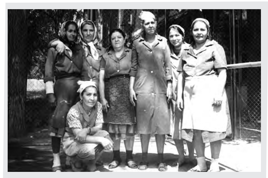
Roma women standing in front of the Tricodava factory in 1976