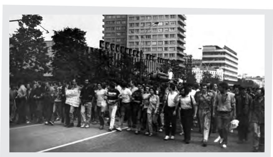
People's march in Moscow, 19 August 1991

These attitudes emerged at the end of the 90s, as a natural consequence of mass disillusionment in the outcomes of both economic reforms, such as unjust privatisation, a sharp growth in wealth inequality and the demonstrative consumption of the rich, and political processes, such as fraudulent elections, corruption, and the abuse of power, in particular, by authorities and law enforcement agencies.