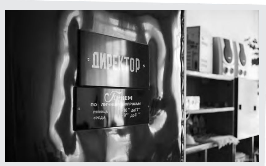
"Director", sign on the door of a public administrative building in Russian in Ukraine with office hours

1991 was a watershed for everyone, but many acknowledge that the changes began prior to that. For some, Gorbachev's perestroika is the historical moment of change, but for others, the Chernobyl disaster is the symbol of the fall of the Soviet system, as trust was irreversibly breached. And while the fall of the Berlin wall has been noted, it is 1991 and not 1989 that marked the beginning of the transition. Everyone agrees that the transformation is not over and the elder generation admits it has made a mistake in being silent about the communist past.