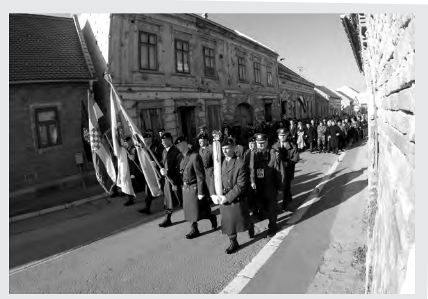
Annual commemoration of the fall of Vukovar

"The Croatian history in the last 30 years can be marked starting with the peaceful and unmoving stagnation of communism, followed by the war trauma, the confusion by the new economic and political system, and the general pessimism that was enhanced by the global recession. There is a difference in the optimism – my generation will never be able to have the optimism that was present in the older generation at the surge of independence, or even before, at the moon landing and such events. The people have lost their perspective worldwide, but Croatia is really extreme" (interview excerpt, Dina, 35).