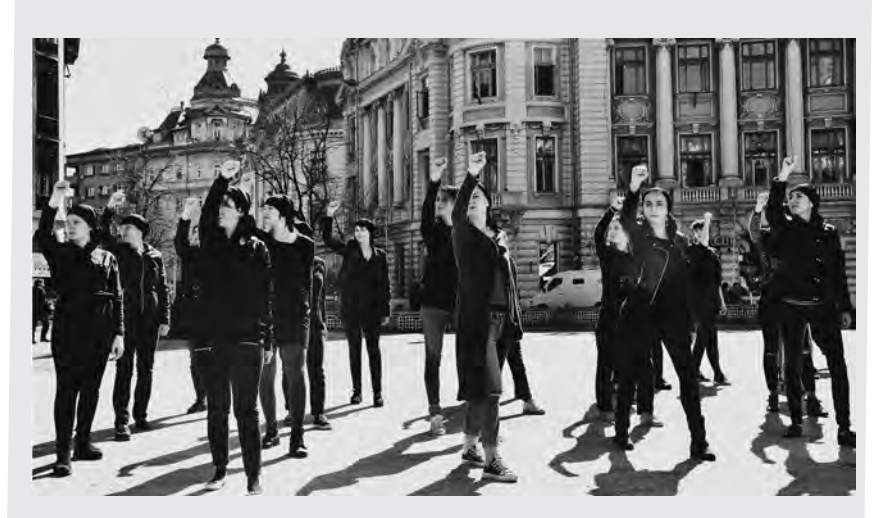
Bucharest street performance for representation and recognition of women in the public sphere, 8\,\text{March}\,2016