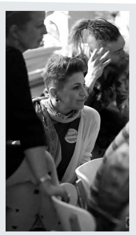
Public discussion, Kyiv

As is to be expected, the generation born in the 80s has fewer memories of the collapse of the Soviet Union, but remembers the hardships and poverty of their childhood. Many of them are filled with remorse, because of the shortages and the difficult upbringing they suffered through.