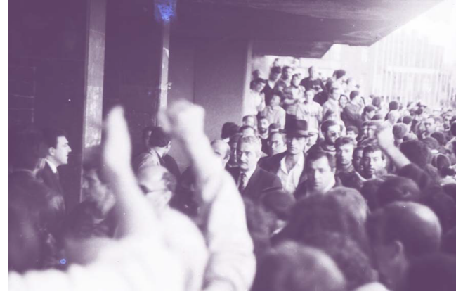
Mass demonstration and civil encounter in the street of Tbilisi, 1991.